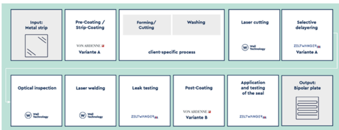
Partial process bipolar plate

Benefit from our knowledge and experience of products in the field of laser cutting and laser welding, for example for the production of bipolar plates in series or for prototypes. We are at your side as an experienced technology and system partner.